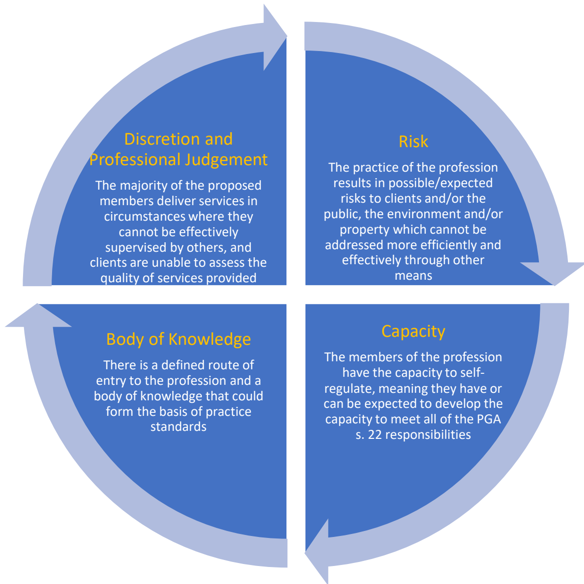
Figure 1 Designation Criteria